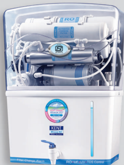
Wall mounted RO water purifier

Give your family 100% Safe & Tasty Water